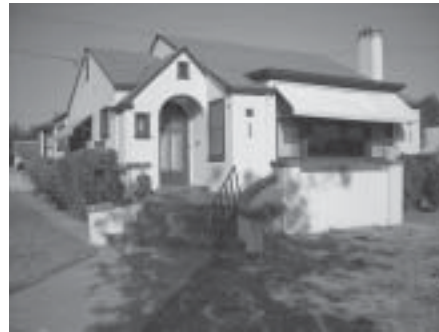
1924 Dutro House, North L and Chestnut Sts., draws Guild attention.